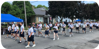
Norwalk High School Marching Band