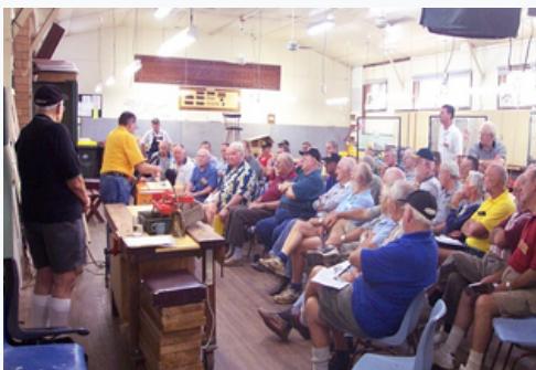
Feb 2005 Triton Demo