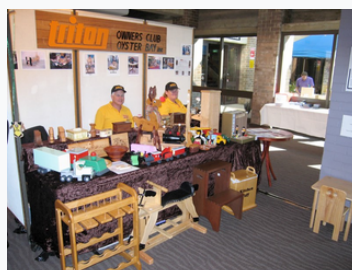
Sutherland Festival Arts & Crafts 2005