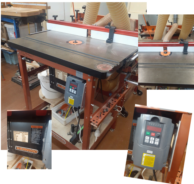
Sherwood Variable Frequency Router