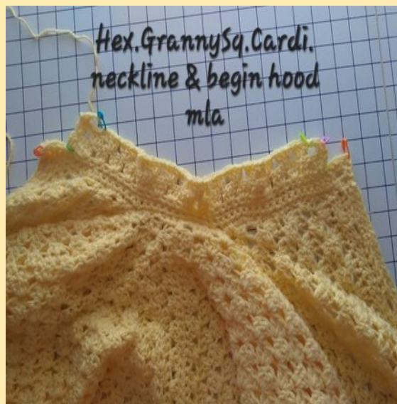
FINISHED ROW 2, BEGIN ROW 3

R3: dc in dc, dc in ch1, * ch1, 3 dc in next ch1 * across row; end row with 1 dc in ch1, 1 dc in next dc, ch3, TURN.