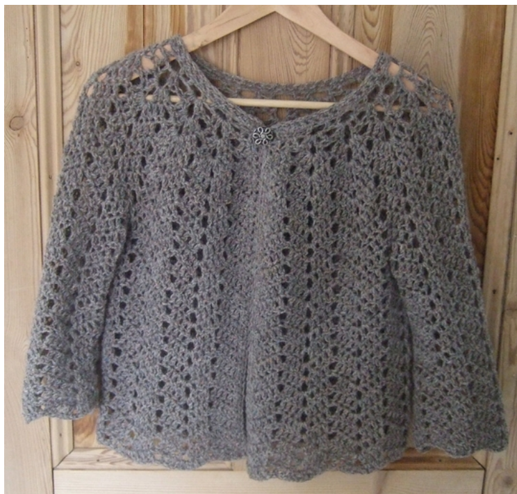
ORIGINAL PATTERN PHOTO

STARTING AT TOP FRONT EDGE, RIGHT SIDE FACING YOU, CROCHET SAME RIBBING AS FRONT BANDS. CROCHET FROM LEFT FRONT EDGE TO RIGHT FRONT EDGE, CH AND TURN. CONTINUE FOR AS MANY ROWS OF RIBBING DESIRED FOR NECKLINE FIT. MAKE BUTTON HOLE ON LEFT FRONT OF NECK RIBBING IN LINE WITH FRONT BAND BUTTON HOLES.