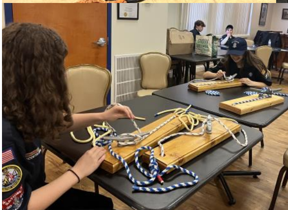
Sea Scout Ship 1959 Open House.