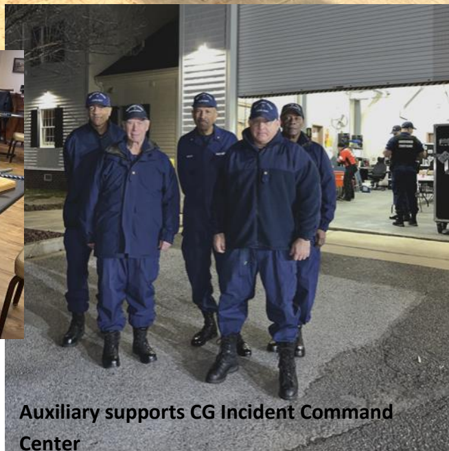
Auxiliary supports CG Incident Command Center