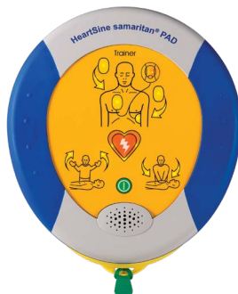
HeartSine samaritan PAD 350P Trainer (TRN-350-XX*)