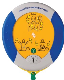
HeartSine samaritan PAD 360P Trainer (TRN-360-XX*)