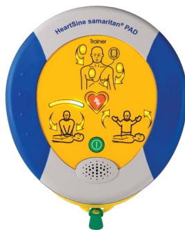
HeartSine samaritan PAD 500P Trainer with CPR Advisor simulation (TRN-500-XX*)

HeartSine samaritan PAD Trainers have no capability to diagnose or treat an arrhythmia. They are intended to simulate the use of an AED for instructional purposes only.