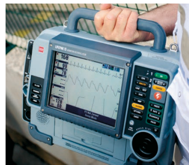
Dual-mode LCD screen with SunVue display