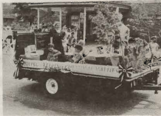
First Place in the civic float category went to EPEC, with the theme "Keeping Cultural Values In Education."