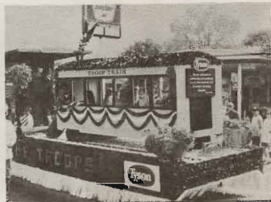
Thson Foods' second place float was a troop train, pulling into the depot at Stilwell

This page made possible through the contributions of the following.