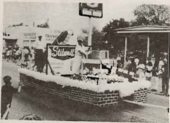
Stilwell Foods had a recreation of their old strawberry processing and canning days

This page made possible through the contributions of the following.