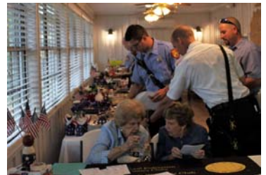
Last year, the First Responder's Breakfast was a big hit!