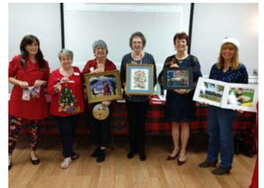
TTWC members enjoy attending the Dist. 8 Arts & Crafts Meeting and Competition.