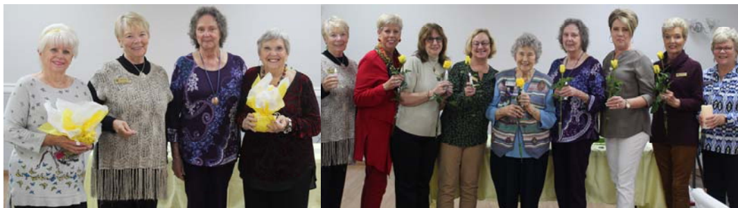
New members were installed at our Jan. general meeting.