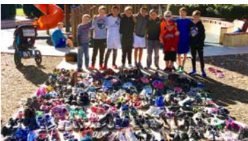
Donate shoes and make a difference in others' lives!

Ladies, Clean out your closet of gently worn shoes by donating them at the February meeting!