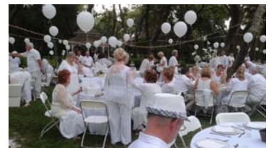
Several of our members are in the Temple Terrace Arts Council and are proud to present Art en Blanc, a stunning outdoor evening picnic.