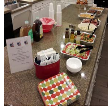
Guests at the Fisher House are always grateful for the wonderful meals we provide for them.