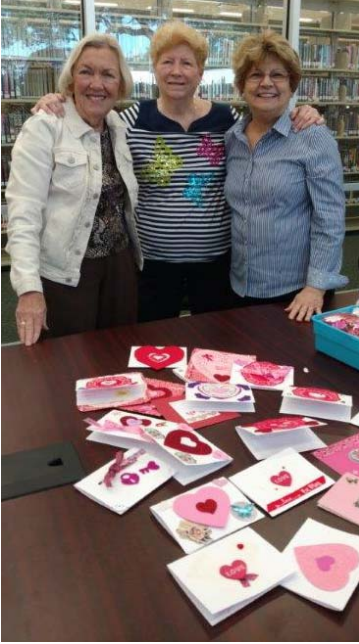
Home Life committee made Valentine's cards for Palms of Temple Terrace.