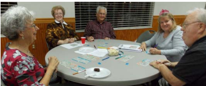
Even the TTWC husbands enjoy Juniorette Bingo to benefit Relay for Life!