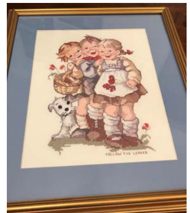
2 TTWC members pieces will be going to GFWC Florida Convention for the Arts & Crafts Competition. Good Luck!