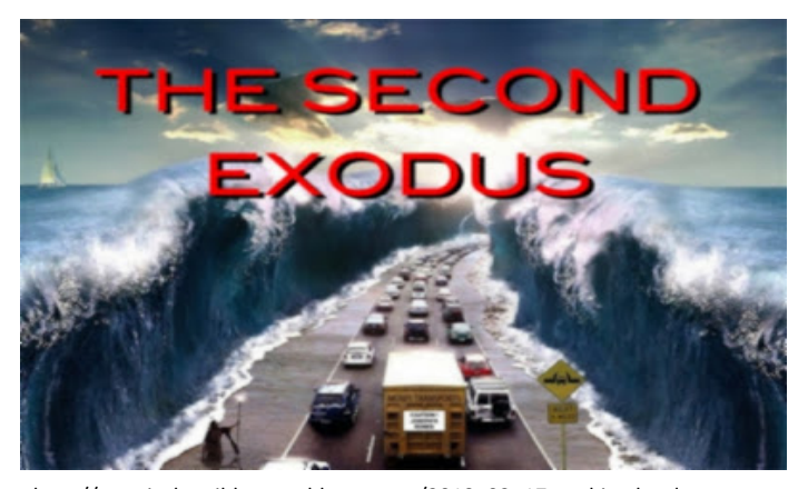
http://cross in the wilderness. blogs pot. ca/2013\_02\_17\_archive. html

Israel and Judah go home together: "I will bring back from captivity My people Israel and Judah,' says Yahuah. 'And I will cause them to return to the land that I gave to their fathers, and they shall possess it'" (Jeremiah 30:3).