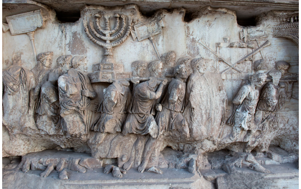
Yeshiva University News

before their Savior could provide their return to God. The battles between the two houses of Israel fueled anger and the focus of these carnal people turned into battles against each other, instead of turning to God and behaving righteously. God, in turn, continues to work with all of them. The house of Israel became jealous of their brother who was awarded the sceptre. They turned away from the great God of