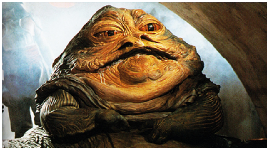
Jabba the Hutt, Star Wars character. Jabba as he appears in Return of the Jedi (1983)

These characters go unseen, but a time will come when they cannot hide. Their physical form will be seen, including evil spirits that have a form like a frog. “ And I saw three unclean spirits that looked like frogs coming out of the mouths of the dragon, the beast, and the false prophet” (Revelation 16:13).