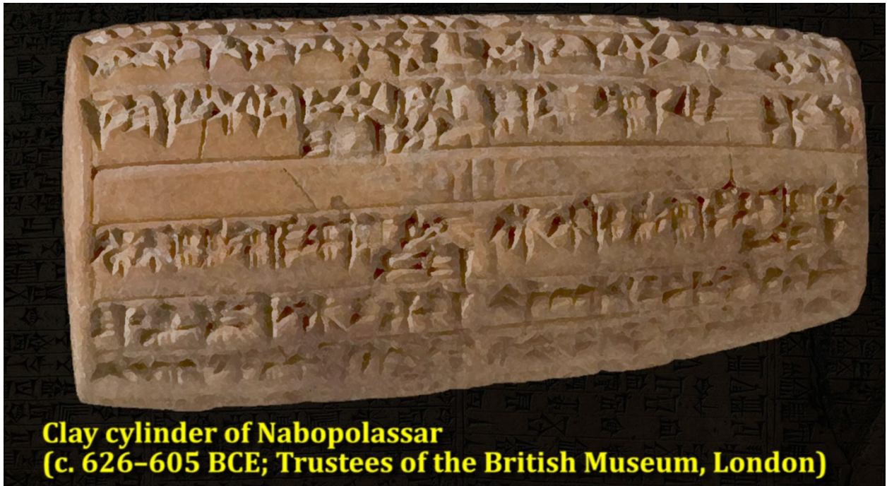
Clay cylinder of Nabopolassar (c. 626–605 BCE; Trustees of the British Museum, London)

To future kings, King Nabopolassar said, “Any king, at any time, whether a son or a grandson who will succeed me, and whose name Marduk will call to exert rulership of the country do not be concerned with feats of might and power. Seek the sanctuaries of Nabu and Marduk and let them slay your enemies. The lord Marduk examines utterances and scrutinizes the heart. He who is loyal to Marduk, his foundations will endure. He who is loyal to the son of Marduk (i.e. Nabu) will last for eternity.” https://www.youtube.com/watch?v=FbFSuO7KHLy