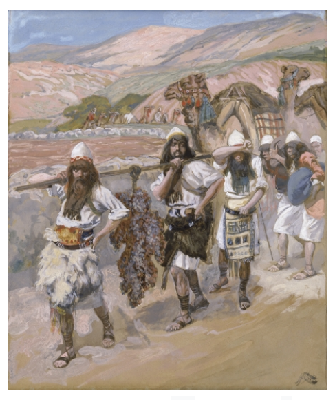
The Grapes of Canaan by James Tissot.

The sight of this enemy was terrifying. Their "height was like the height of the cedars and who were as strong as the oaks" (Amos 2:9). They were seen by the twelve who spied out the land as a powerful people, "the cities are fortified and very large. We even saw descendants of Anak there... The land we explored devours those living in it. All the people we saw there are of great size. We saw the Nephilim there (the descendants of Anak come from the Nephilim). We seemed like grasshoppers in our own eyes, and we looked the same to them" (Numbers 13:28-29a, 32b-33).