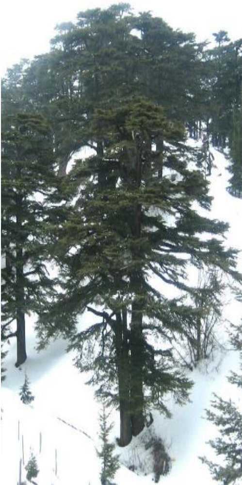
The Forest of the Cedars of God.

This heavenly ruler over the kingdom of Assyria on earth fell because he "was proud of its height" (Ezekiel 31:10). He became a raging and crazed tyrant warring against weaker nations and overpowering them, expanding his kingdom beyond the original boundary. Through King Sennacherib, this tyrant threatened to take Jerusalem during the reign of King Hezekiah. The General of Sennacherib boasted of their military achievements and threatened the invasion of Jerusalem, "Do not let the god you depend on deceive you when he says, 'Jerusalem will not be handed over to the king of Assyria'" (Isaiah 37:10). King Hezekiah prayed to the God of Israel who is Almighty, and He responded directly to the heavenly ruler over Assyria,