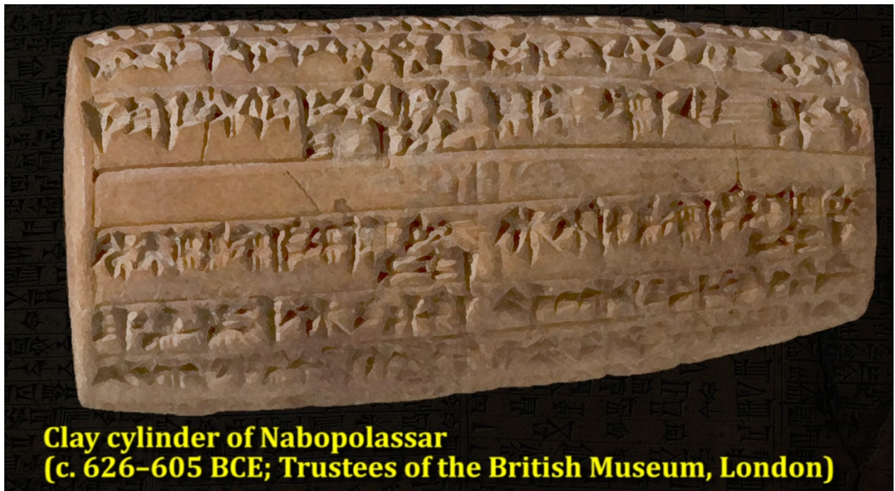
Clay cylinder of Nabopolassar (c. 626–605 BCE;)

To future kings, King Nabopolassar said, “Any king, at any time, whether a son or a grandson who will succeed me, and whose name Marduk will call to exert rulership of the country do not be concerned with feats of might and power. Seek the sanctuaries of Nabu and Marduk and let them slay your enemies. The lord Marduk examines utterances and scrutinizes the heart. He who is loyal to Marduk, his foundations will endure. He who is loyal to the son of Marduk (i.e. Nabu) will last for eternity.” https://www.youtube.com/watch?v=FbFSuO7KHLy