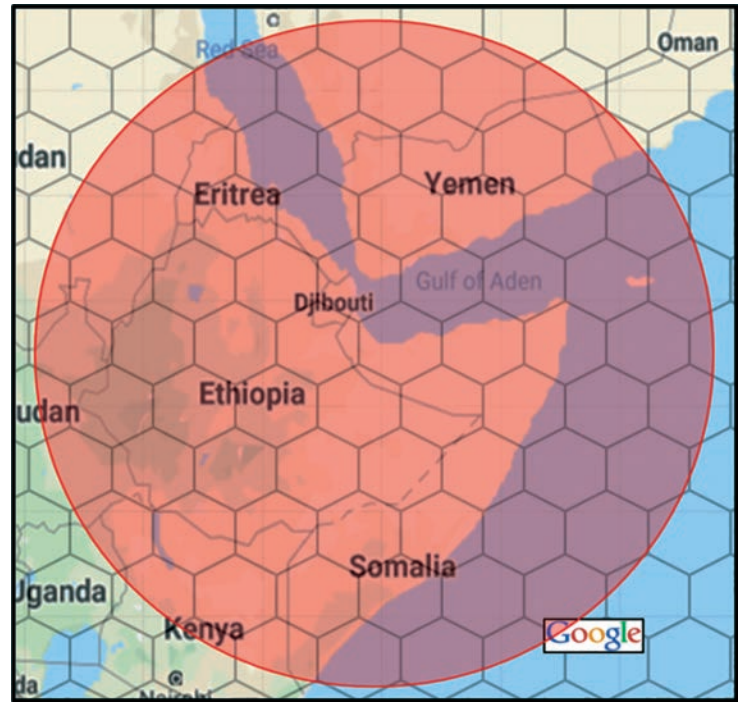
Figure 2. Comparison of beam sizes for different satellites.

LEO systems do have at least one advantage: the potential for coverage at the Earth's poles. With the exception of service in these areas, though, GEO satellite systems consistently provide significant advantages as a platform for Satellite IoT. A detailed report comparing the LEO and GEO alternatives is available from the author.