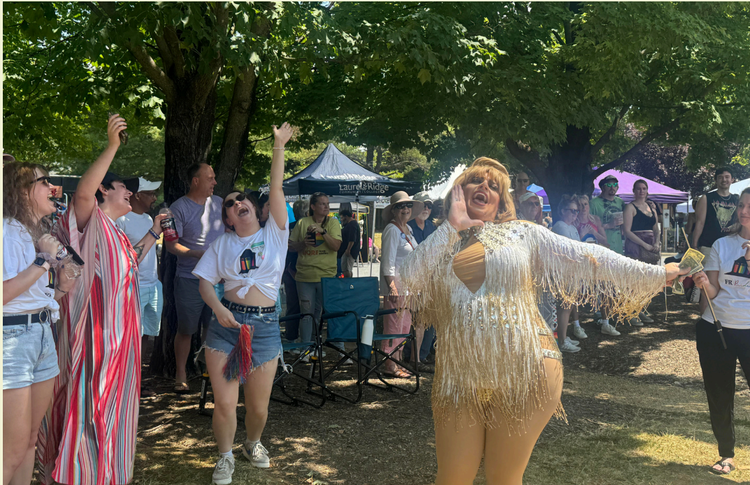
Crowd turns out for Front Royal's first Pride event

Find the best option for you? Is the Skyline Drive option calling your name? Send an email to contact@frpride.com to discuss payment options!