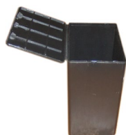
Basic Plastic Container 8.25" x 6.5" x 4.5" 200 cubic inches $ Included