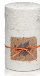
Peaceful Return Biodegradable Scattering Urn 11.25" H x 6.75" W x 5.5" D 215 cubic inches $ 240.00