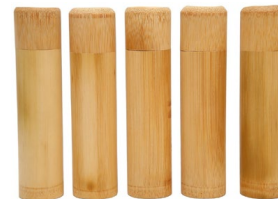
5 Bamboo Sharing Tubes 5.9" x 1.4" 9 cubic inches each $ 195.00