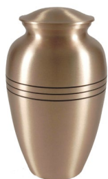
Traditional Bronze Urn 10.5" x 6" x 6" 200 cubic inches $ 295.00