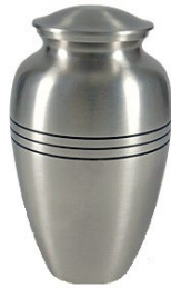
Brushed Pewter Urn 10.5" x 6" x 6" 200 cubic inches $ 295.00