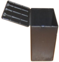
Basic Plastic Container 8.25" x 6.5" x 4.5" 200 cubic inches $ Included