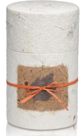
Peaceful Return Biodegradable Scattering Urn 11.25" H x 6.75" W x 5.5" D 215 cubic inches $ 185.00