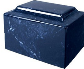
Kenzy Cultured Marble Urn 9.75" x 6.75" x 6.5" 200 cubic inches $ 390.00