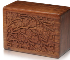
Rosewood Hand Carved Urn 5" x 9.5" x 6.5" 218 cubic inches $ 145.00