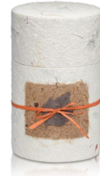
Peaceful Return Biodegradable Scattering Urn 11.25" H x 6.75" W x 5.5" 215 cubic inches $ 185.00