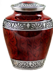
Espresso Brown Alloy Urn 9" x 6.9" 200 cubic inches $ 385.00