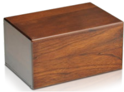
Basic Catalpa Wood Urn 8.5" x 6.5" x 4.5" 200 cubic inches $ 85.00