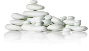
Parting Stone Solidified Remains 40 to 80 "stones" various sizes shapes, color, and texture Requires 8-10 weeks to produce. $ 2585.00