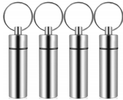
4 Capsule Keepsakes Tubes Brushed Silver / Approx 2" Pictured Design Might Vary $ 100.00