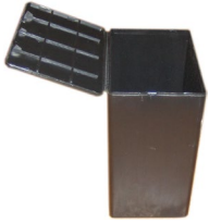
Basic Plastic Container 8.25" x 6.5" x 4.5" 200 cubic inches $ Included