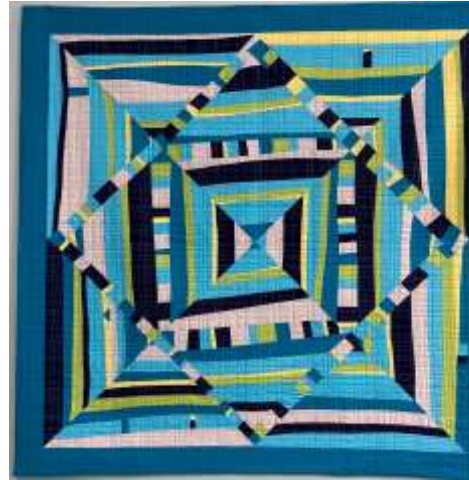
Approx. 40" x 40"

This is such a fun quilt to make. It's very improv, and a nice change from having to be so exact.