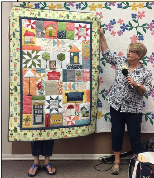
Kimberbell "Make Yourself at Home" -- lots of piecing and applique!