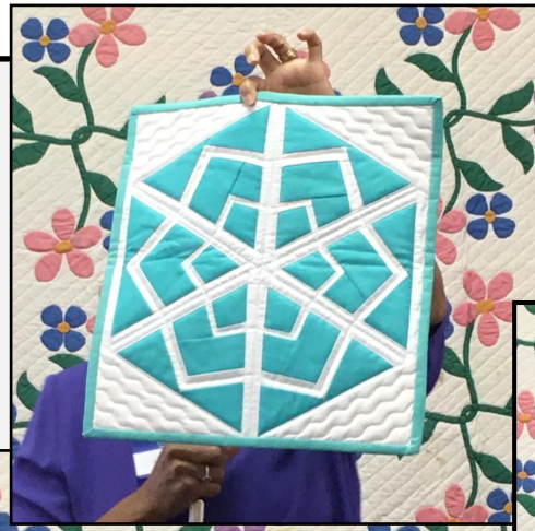
Diane Roberson's "Crystal Star"