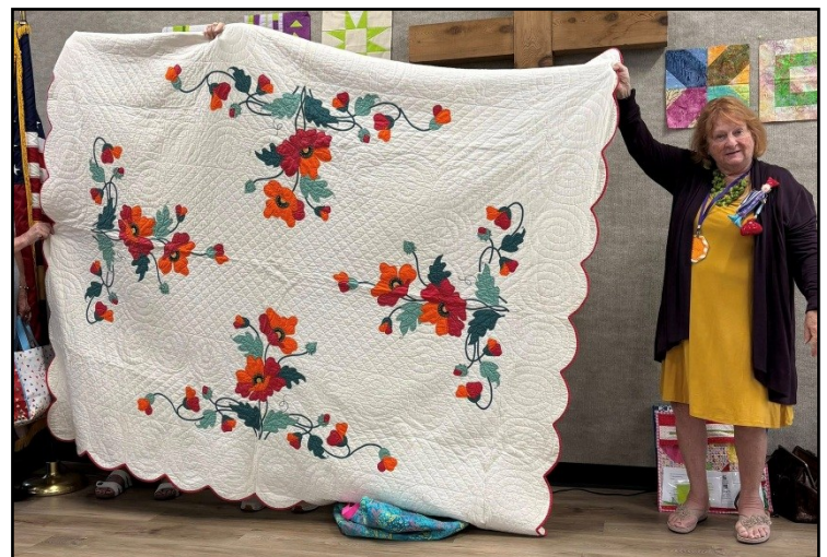
Bobbie Dye bought this vintage quilt with appliqued flowers at Goodwill for less than $6, and had to rescue it.