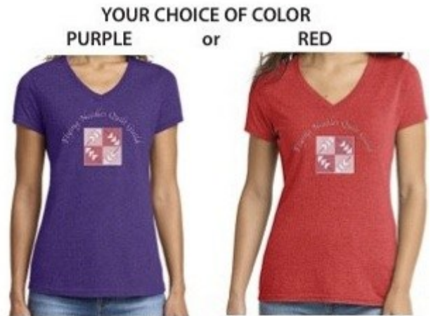
PORT & CO™ Women's Blend V-Neck Tee.