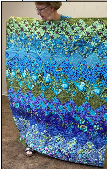
Three quilts and a short table runner by Deb Chilcote