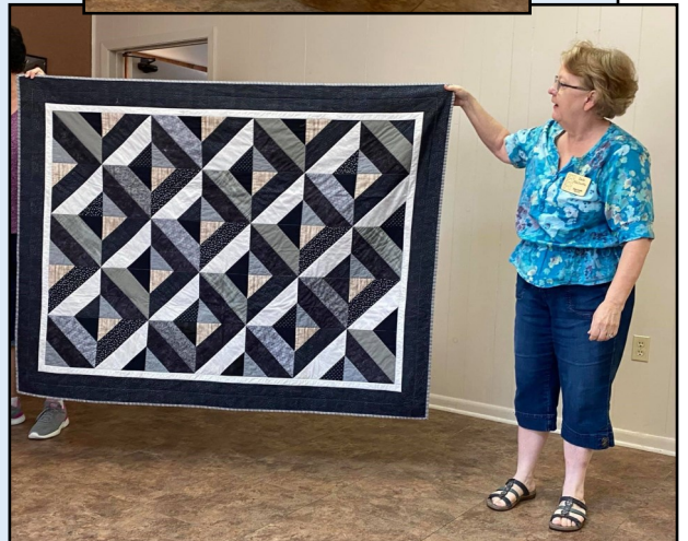
Clockwise from left -- a cascade design from Tula Pink fat quarters, Sew Kind of Wonderful pattern Posh Penelope, Kaleidoscope baby quilt, and geometric design for her daughter's boyfriend