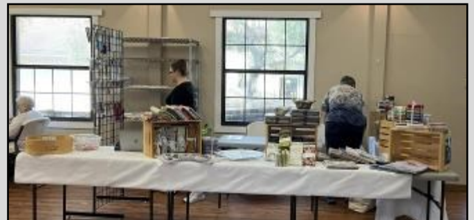
Sit 'n' Sew , and our retreat vendor, The Sewing & Training Center of Ft. Walton Beach, all in the Auditorium, along with the Registration table, Challenge Block display, Quilt of Valor blocks, and Quilters' Walk.

Door prizes were handled by Kaye Joachim and Deborah Moen . Each day, names of all participants for that day were put in a basket, and 10 names were pulled to receive door prizes, for a total of 30 door prizes for the weekend, plus the centerpieces on the last day.