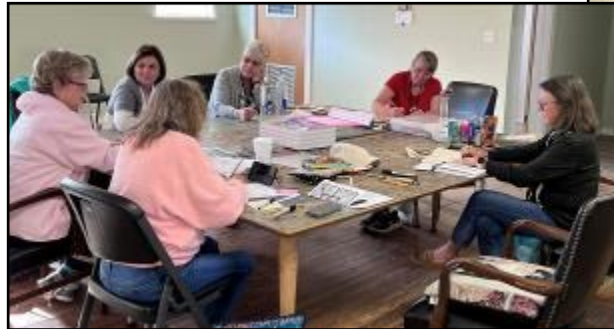
Upstairs from the Dining Hall was a space for two classes.