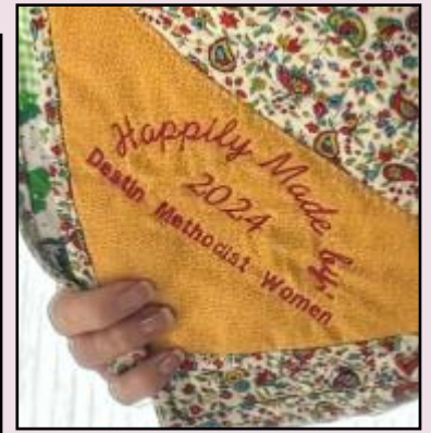
A quilt Patty assembled called "One Year of Blocks", with label.