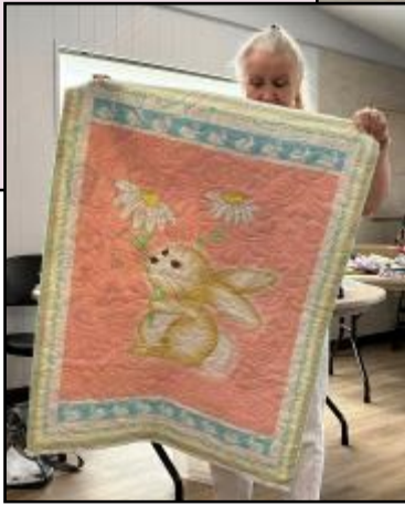
An Easter quilt