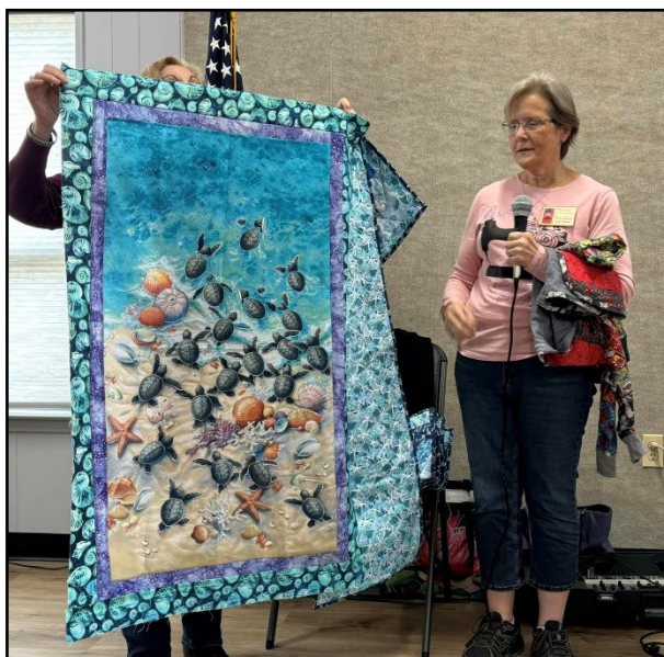
Michelle hasn't finished this one yet, but it is a turtle panel she bought at Coastal Stitches.