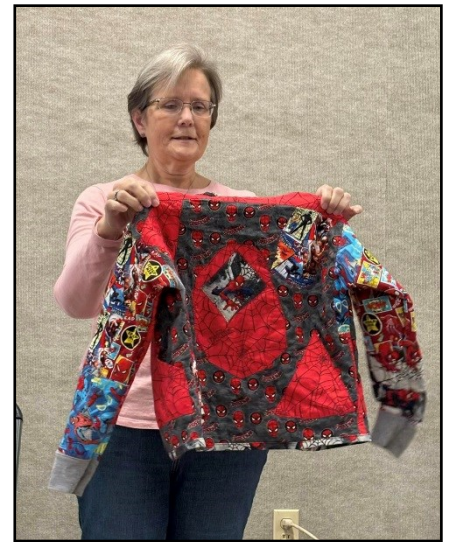
Next up are jackets made for her grandsons, using a sweatshirt as a template -- the left one has a Mine Craft theme, and the right one has a Spider-Man theme.