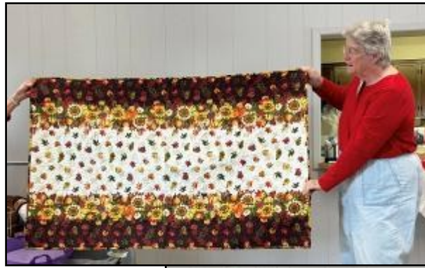
Ginger Maddox didn't want to cut this fabric, so she made a table runner out of it. Backing fabric was sunflowers.