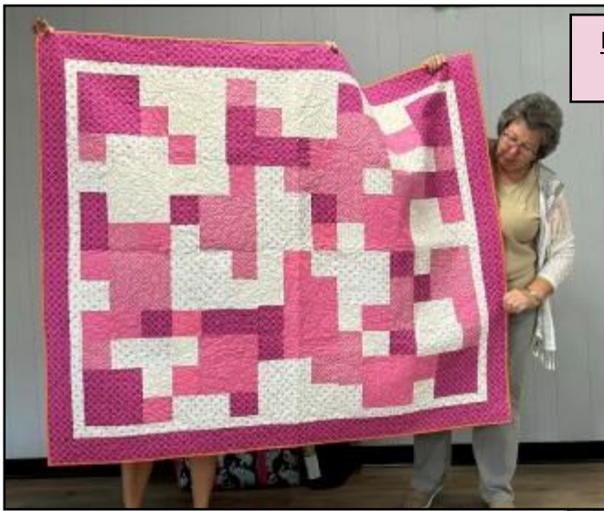
Polly Shields made this pink quilt that has an overall floral quilt pattern.