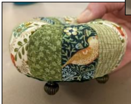
UFO.... Karen also made this cute pin-cushion that is like a tuffet with wooden feet, and a button on top that is in the shape of a thread spool.