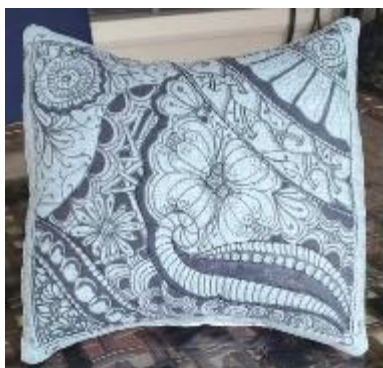
Let's Zentangle Taught by Cherie Matheson