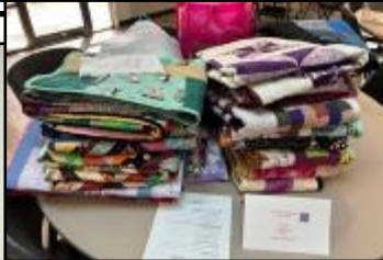
Hailey White from Children's Advocacy accepted our generous donation of 140 stockings, 34 quilts, 8 receiving blankets, and 31 drawstring bags.