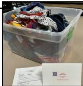
Leslie Fuller from The Pearl Project accepted our donation of 24 drawstring bags.