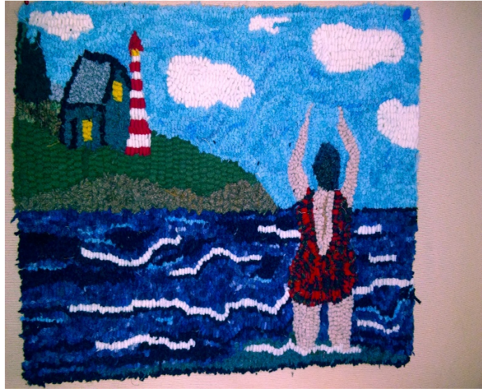
Small hooked piece. This reminds me of summertime in Maine.