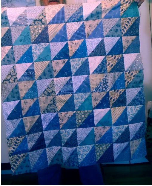
Table topper that needs to be layered and then will be hand quilted.