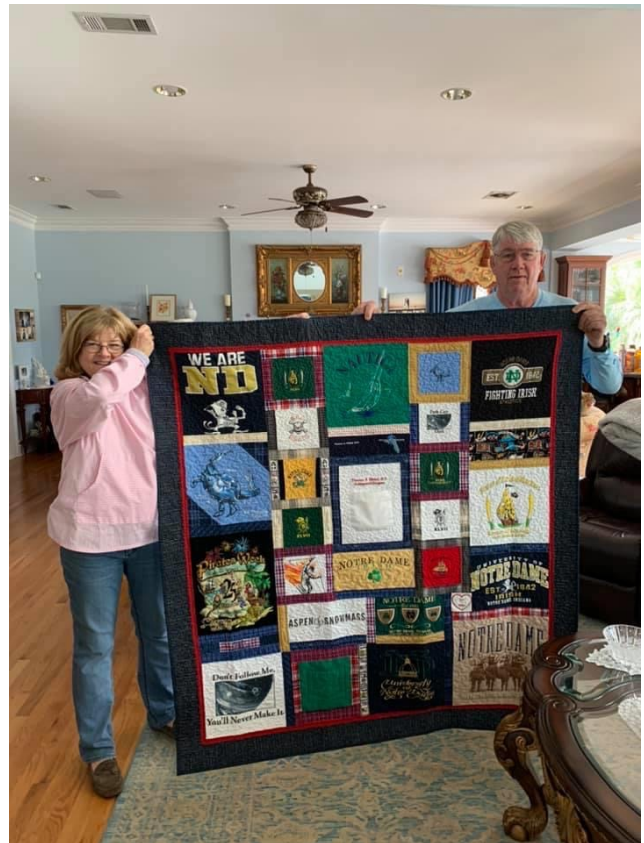
T-shirt quilt for commemorating local doctor who passed away last year.