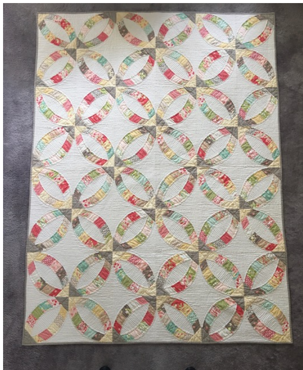
Metro Rings quilt started at the retreat