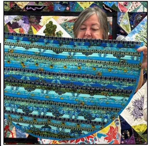
Debbie Daigle made this Blue Slice rug