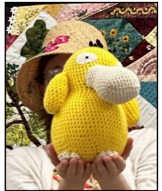
Eliza Dalton made a couple more crocheted Pokémon characters