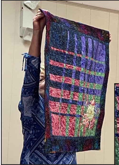
Linda Weiss also had an applique of flowers in the corner of hers