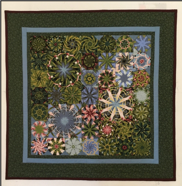
Deb Chilcote's One Block Wonder (OBW) using two sizes of octagons in a wallhanging