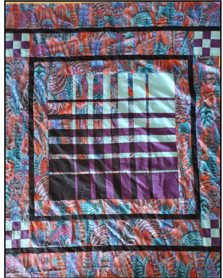
Theresa Ring was quick to put hers together in class!