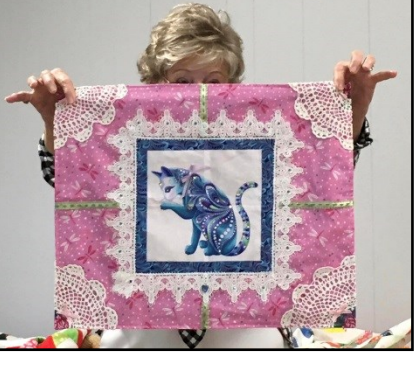
Pat Ferrell showed her table topper with Easter colors and fancy cat with a little bling!