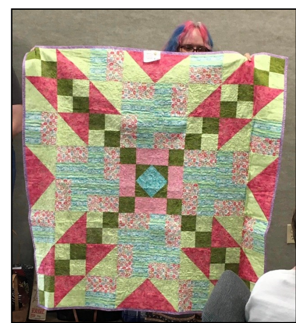
<u>Angel Schauer</u> finished 2 table toppers quilted in the hoop.