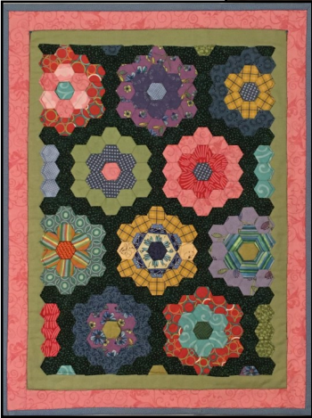
Deb Chilcote's doll quilt with 1/2" hexies (EPP)