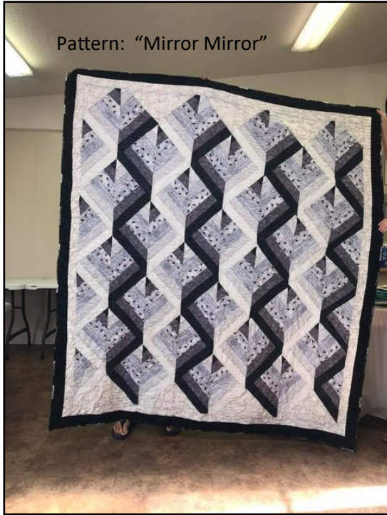
Pattern: "Mirror Mirror"