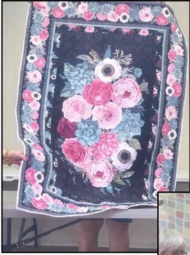
Sandra Congleton's many quilts - Attic Window, Panel, Baby Quilt, and Stars with Squares