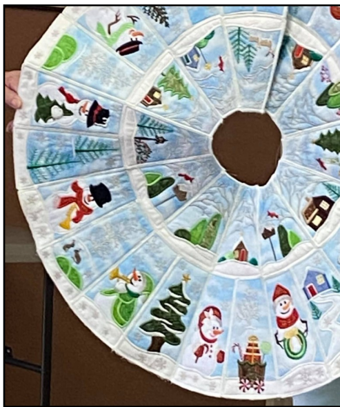
Gail Menard's Christmas tree skirt made with machine embroidery