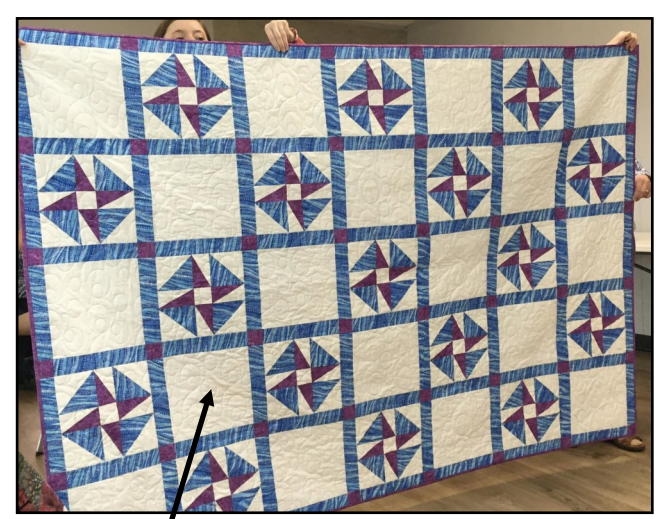
Anne just HAD to make this quilt -- pattern is called "Crazy Anne"!