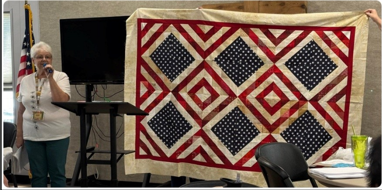
Barbi Quellette presented two quilt tops made with patriotic blocks like the ones in our July BOM program. The Silver Threads Quilt Guild made the top one called "Silver Stars", and some in the Flying Needles guild made the bottom one called "Flying Stars".