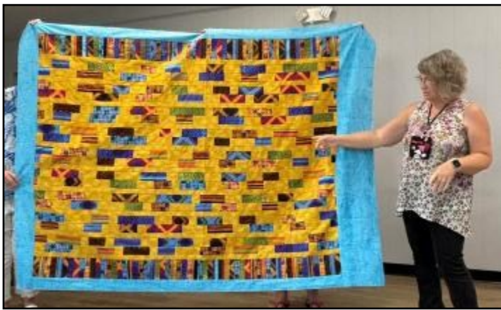
Sherry Kruschke made this quilt top from some strips that she bought at the guild's Garage Sale, and added to it. The strips are 1-3/4" wide.