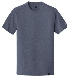
C. New Era® Heritage Blend Crew Tee $15.00 Navy heather or white Mens S-XXXL Ladies Vee XS-XXXL