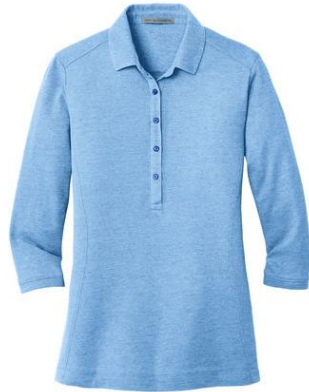
H. Port Authority® Ladies Coastal Cotton Blend Polo $27.00 XS-XXL White or Lt blue