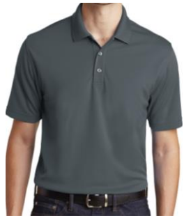
A. Port Authority® Dry Zone® UV Micro-Mesh Polo $25.00 Navy or Grey Mens S-XXXXL Ladies S-XXXXL