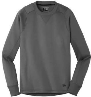
G. New Era® Venue Fleece Crew $58.00 Grey or navy unisex XS-4XL