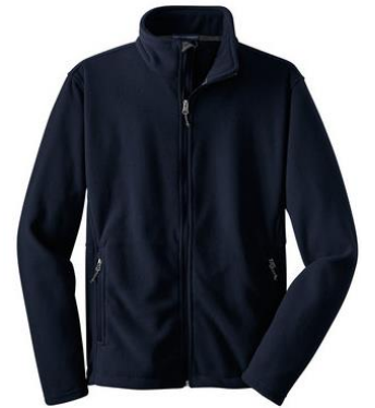
K. Eddie Bauer Full Zip Fleece Navy $60.00 S-XXXL Mens S-XXXL Ladies