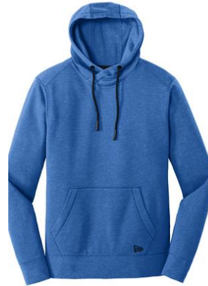
I. New Era® Tri-Blend Fleece Pullover Hoodie $45.00 Unisex XS-XXXL navy or royal