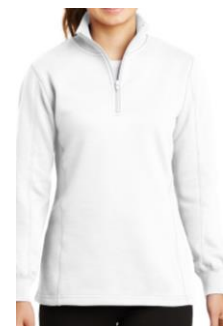
D. Sport-Tek® 1/4-Zip Sweatshirt $38.00 White or navy Mens XS-XXXL Ladies XS-XXL