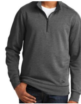
J. New Era® Tri-Blend Fleece 1/4-Zip Pullover $58.00 Unisex XS-XXL navy or black