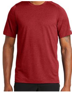
B. New Era® Series Performance Crew Tee $25.00 Crimson or navy Mens XS-XXXL Ladies XS-4XL