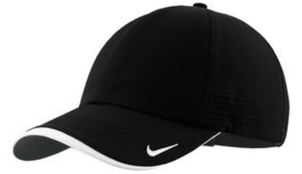
E. Nike Dri-FIT Swoosh Perforated Cap $28.00 Navy or black