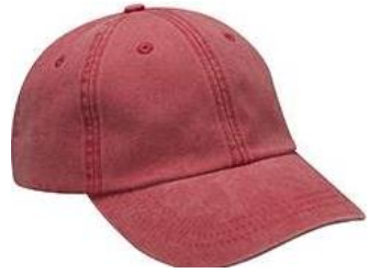
F. Adams Optimum Pigment Dyed-Cap $24.00 Leather back Washed navy or washed red