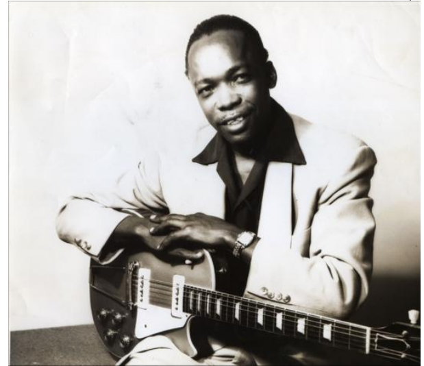
John Lee Hooker