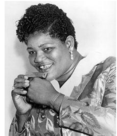
Big Mama Thornton