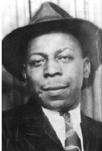
Big Maceo Merriweather