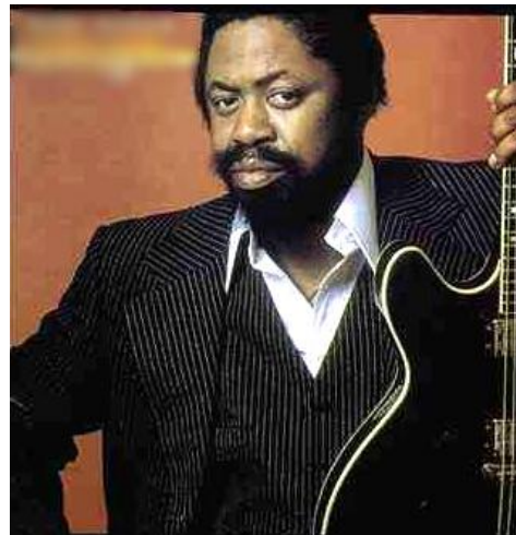
Frank "Son" Seals