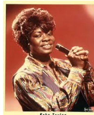
Koko Taylor Koko Taylor