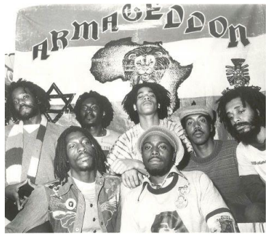
"Armageddon" 1982, the most talented Reggae Band in Chicago

osezua, barack obama's song. A talented singer "Osezua" dedicating this song to Barack Obama