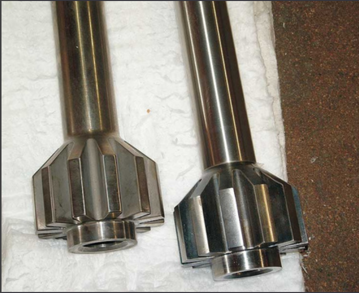
CV Spline Stems