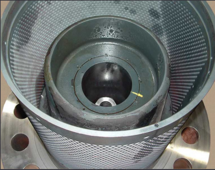
Throttle Valve Bonnet- Reconditioned