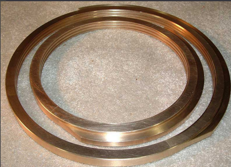
Main Oil Pump (MOP) Seals