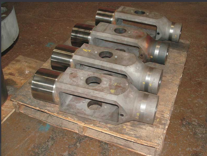
Control Valve Crossheads-Reconditioned