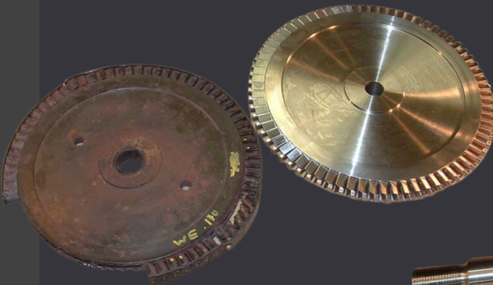
Industrial Turbine Wheel-Rebladed

Our capabilities encompass the manufacturing of both new valve parts and the refurbishment of existing ones. This includes stems, discs, bushings, valve seats, and strainers.