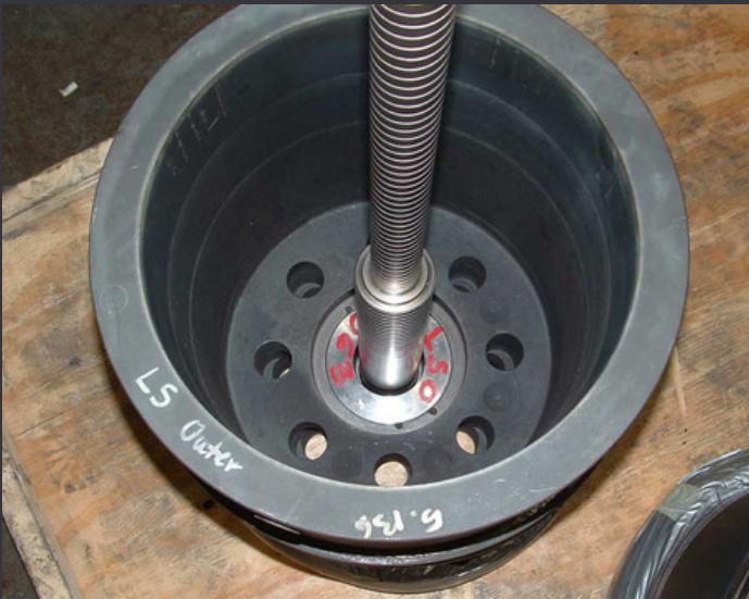
Intercept Stem-Disc Assembly-Reconditioned