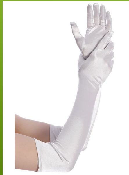
ORDER GLOVES (MUST BE WHITE)