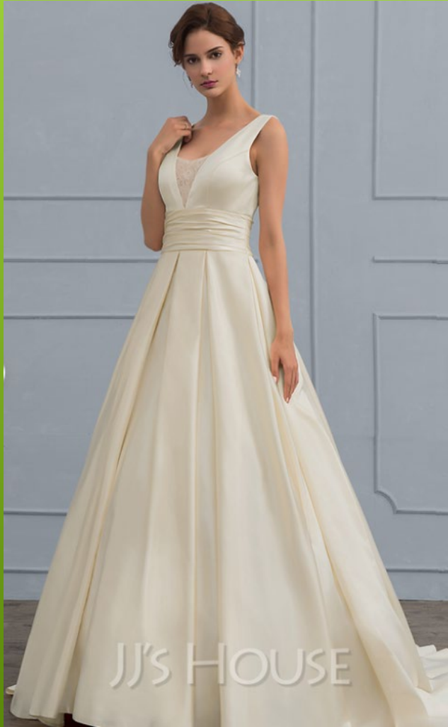
ORDER DRESS (MUST BE WHITE)