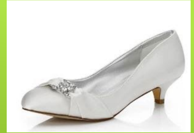
Footwear for Princesses can be any appropriate medium to low heeled evening shoe in white. An example is shown above.