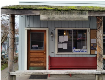
Post planned Shaw PO Open now 4 hour per day