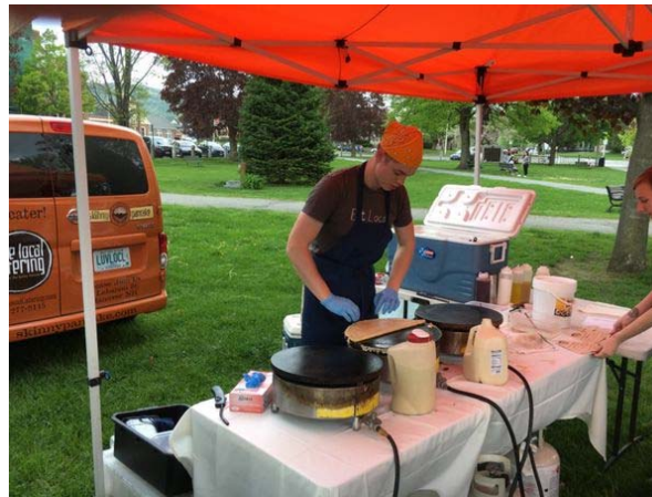
Crepes, like strolling on a Paris street

The Lebanon Farmers Market is a wonder of good eats: jerk chicken, empanadas, pad thai, Skinny Pancake crepes. The veteran Boisvert's food truck with its burgers, and fresh lobster rolls with melted butter or mayo, always an impossible choice.