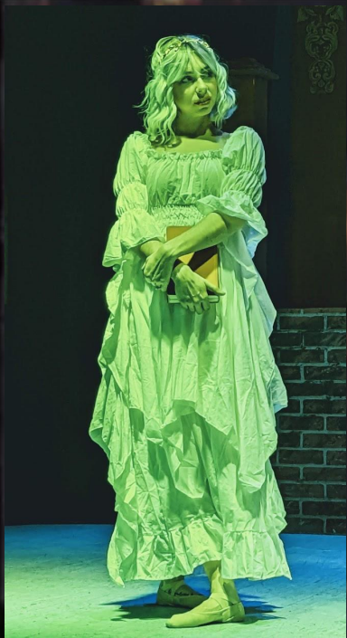
Ghost of Christmas Past