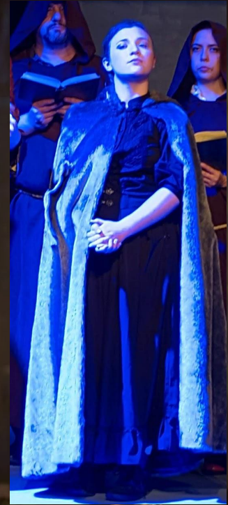
Ghost of Christmas Yet to Be