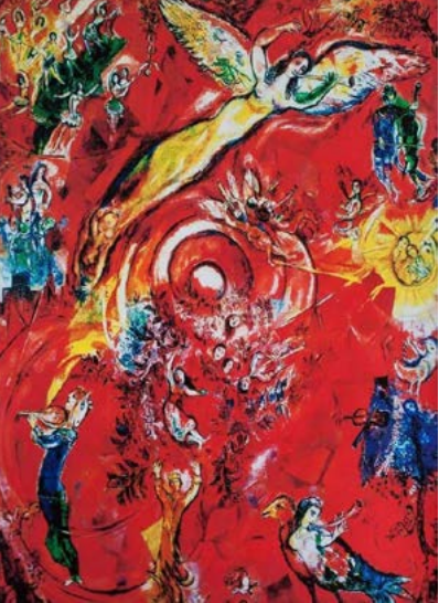
The Triumph of Music

Both paintings combine music, theatre, and dance, portraying the power of humanity and the performing arts. This seemed to me a good starting place for Once Upon A Mattress . The essence of this production is the natural interaction of actors blended with music, dance, and vibrant color to create the timeless, magical realm in which they live.