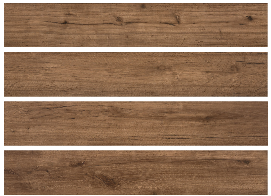
19.7 x 120 cm | 8"x48" [RECTIFIED] AC ( SATIN ) DCOF WET ≥ 0.42 - V3 - HD - 27 FACES